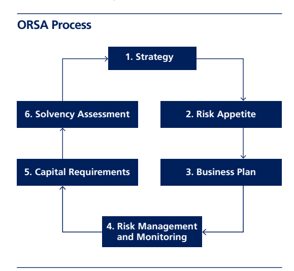
Chart 4: ZIP ORSA process

The ORSA process is governed by the ORSA policy, which includes the following: