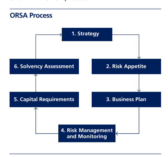
Chart 4: ZIP ORSA process

The ORSA process is governed by the ORSA policy, which includes the following: