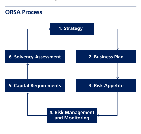
Chart 4: ZIP ORSA process

Governance of the ORSA process is mandated by the ORSA policy, which includes the following: