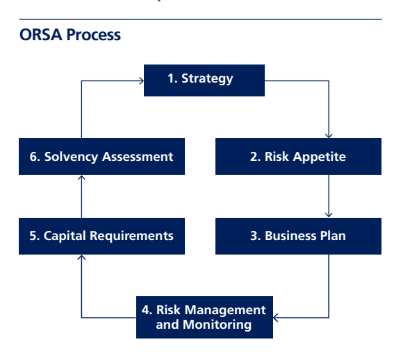
Chart 3: ZIP ORSA process

The ORSA process is governed by the ORSA policy, which includes the following: